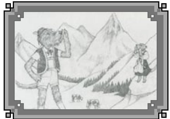
No Yodeling Required! It's not that kind of echo!

Echoes will be available all day Thursday and Friday, April 27 and 28, at the Purina Farms show site. However, appointment times are limited and reservations are required, so stop by the IWF Health Testing Tent and sign up your wolfhound.