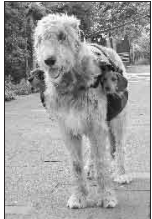
A HELPING HOUND

The Irish Wolfhound Association of the Garden State's 2005 raffle will raise money to fund this research. If you would like to purchase raffle tickets, visit the IWAGS website ( www.iwags.org ). The drawing will be held at the IWAGS Specialty, October 30 and 31, 2005.